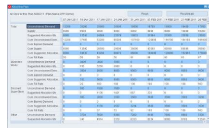
Figure 2: Horizontal Plan